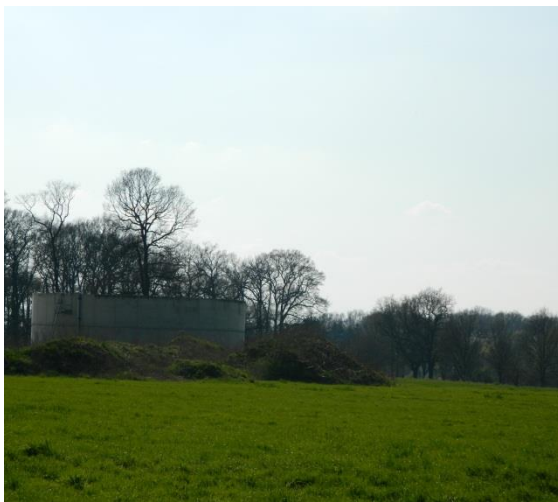
Slurry storage – destruction of landscape