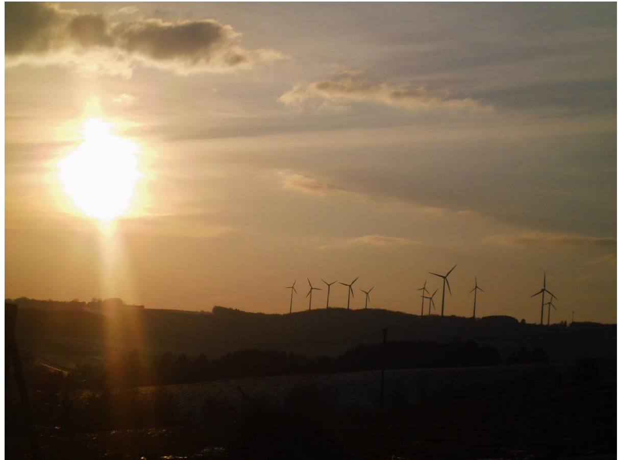
Landscape Extertal, example for ugly vs. beautiful