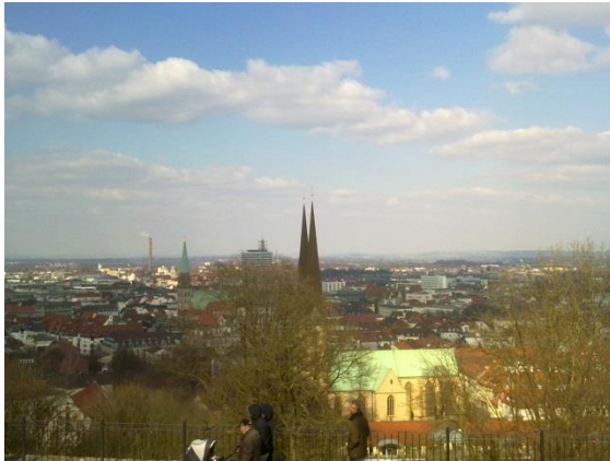
Example for urban landscape – the city of Bielefeld a city near Herford.

On this side we want to show some more pictures that were shown in the gallery.